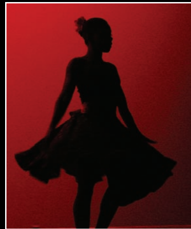
photographer Paula Grez